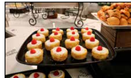
Hors d'oeuvres and desserts were served.