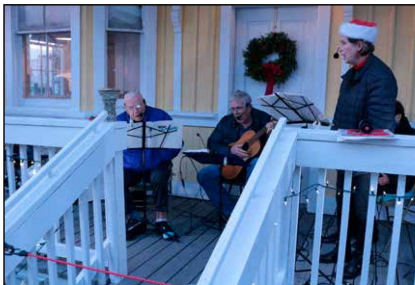
A trio of musicians calling themselves Senior Moments presented railroad and holiday songs for visitors at the Beaches Museum "Holidays in the Village" event.