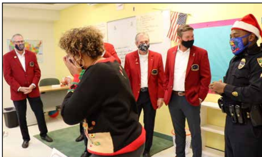
THE PLAYERS Red Coats surprise members of the Police Athletic League of Jacksonville with a $10,000 donation to the organization.

While JaxPAL was expecting a ribbon and recognition for their artistic efforts, they were instead surprised with a $100 award for each branch and a $10,000 donation to their organization. These funds will be used to help JaxPAL offset the financial and operational challenges they have faced due to COVID-19. The Eastside location recently opened, following a fire that severely damaged their location at the onset of the pandemic.