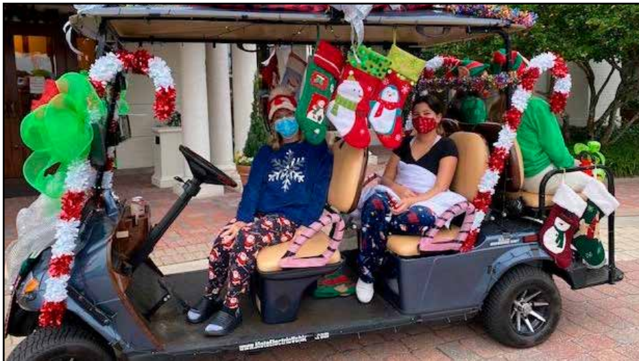
A decorated golf cart parades through the streets around the Ponte Vedra Inn & Club.