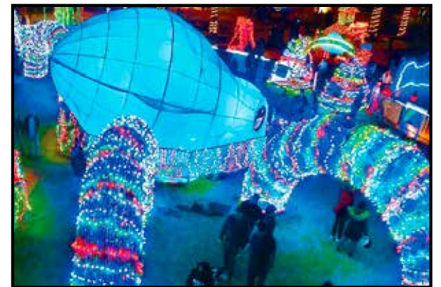
Beaches Go Green's octopus garden placed third.