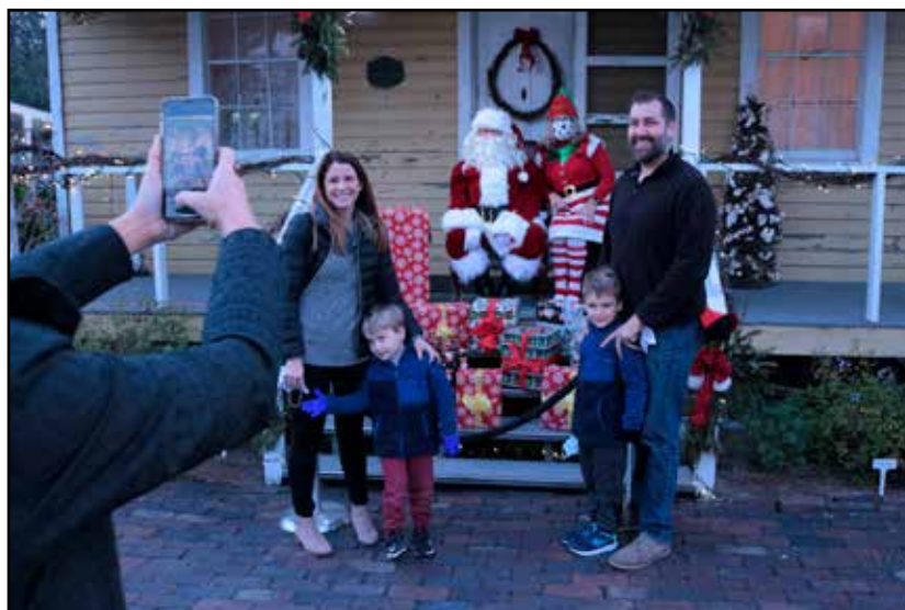
A local family poses for a photo with Santa and his elf during the Beaches Museum "Holidays in the Village" event on Thursday, Dec. 17.