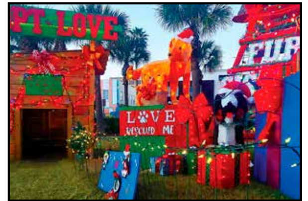
Fur Sisters placed second at the 2020 event.