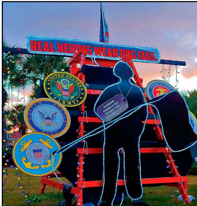
The American Legion's display at Deck the Chairs won Best of Show.