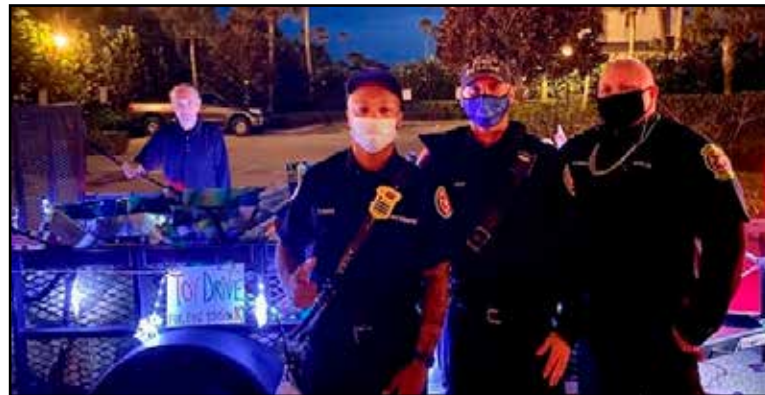
The Ponte Vedra Community Association holds a luminary parade and toy drive Dec. 6. The annual toy drive for first responders at Fire Station 10 is a big factor for the PVCA.